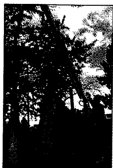
Once the monument arrived on campus, the next step was to move it from the transporting flatbed to the prepared site.