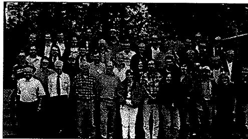
Surveying alumni proudly pose for a group photo.

if it were an altar made of gold, gently feeling its smoothness and searching for names. Some rubbed their names on paper with charcoal to memorialize the occasion. Everyone present—both alumni and friends—were moved by the significance of the monument and the moment.